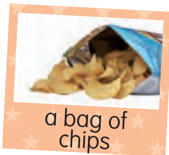
a bag of chips