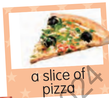
a slice of pizza