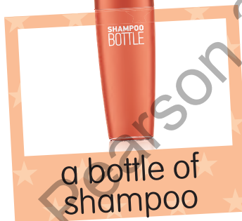
a bottle of shampoo