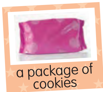
a package of cookies