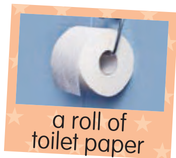
a roll of toilet paper