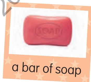
a bar of soap