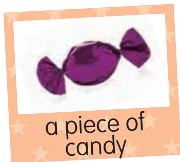
a piece of candy