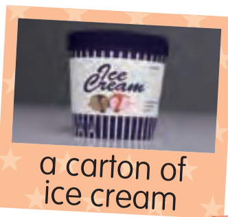
a carton of ice cream